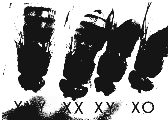
Fig. 1. Ebony-variegated flies from the same 18^{\circ} culture: XYY=T(1;3)20;93D, red e^{H2}/+ ;In(3R)C, Sb e^{1(3)}e / B^sY , XX=T(1;3) e^{H2}/+ ;In(3R)C, XY=T(1;3) e^{H2}/B^sY ;In(3R)C. An XO=T(1;3) e^{H2}/0 ;In(3R)C male is also shown.

Such Y-suppressibility accords with the interpretation that this mutation is a position effect that variegates for the ebony gene. Typical examples are shown in Fig. 1.