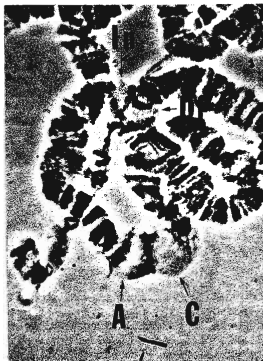
Fig. 2. a) Part of chromosome 3R from a larva of genotype In(3R)84C;93D2-3, red e^{H3}/Df(3R)93B10-13;93D2-3 , red e^{H5} squashed immediately after dissection. b) Example of 3R from the other salivary gland of the same larva held 15 min at 37^{\circ} before squashing. Df and In indicate the 93D puff sites on deficiency and inversion chromosomes respectively. For references, A and C indicate the sites of the heat-shock puffs in 87A and 87C.

References: Brosseau, G.E. Jr. 1970, DIS 45:100; Scalenghe, F. and F. Ritossa 1977, Chromosoma (Berl.) 63:317; Korge, G. 1972, DIS 48:20.